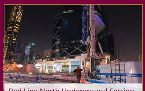
Red Line North Underground Section

More exciting projects are expected to start for WJ in the first quarter of 2015, so watch this space.