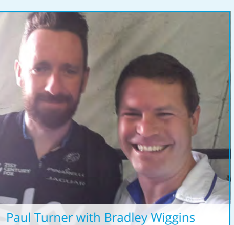
at the Tour of Oatar

"We race in UCI organised events and although the UAE is yet to create a professional league the local cycling federation was established as long ago as 1974. Ex-pats have been able to join since 2012. Frankie's regularly compete against the main Emirati teams: Al Wasal and Ah Ahli. We meet 2 to 3 times per month for a race and we expect to win the master category this year!"