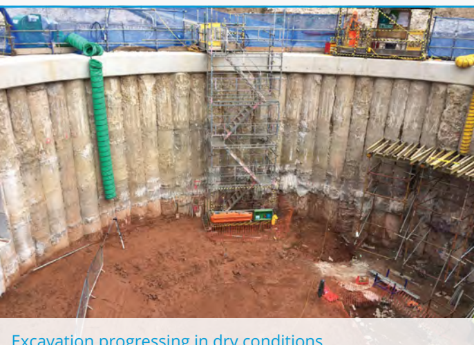
Excavation progressing in dry conditions